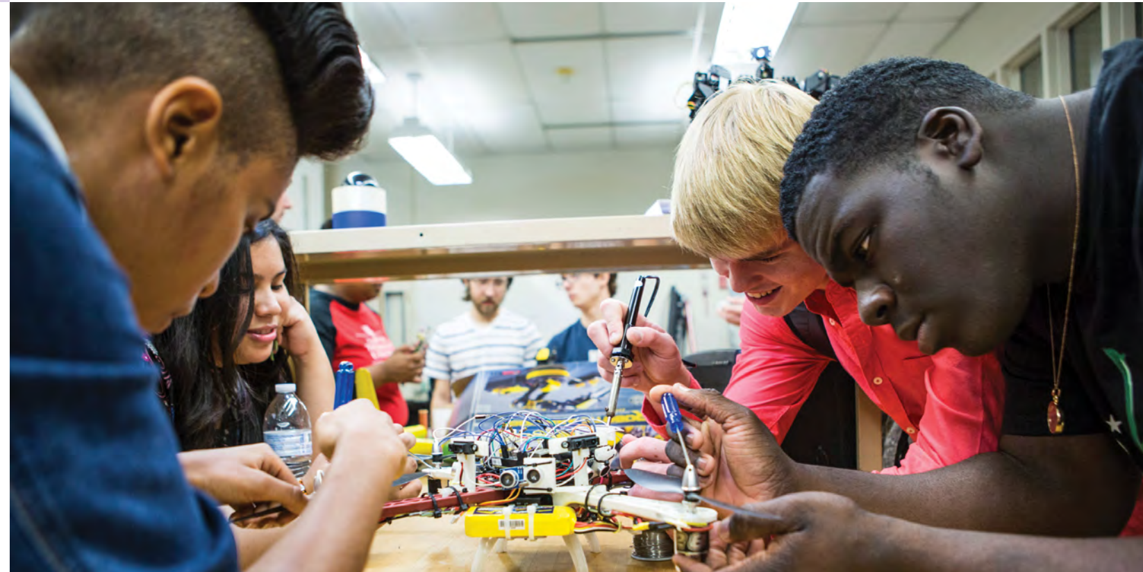
Students at Capitol Technology University.

To meet this goal, the U.S. will need to increase the number of students who receive undergraduate STEM degrees by about 34 percent annually. Merely increasing the number of STEM majors who stay with their programs through graduation from the current rate of 40 percent to 50 percent would generate three-quarters of the one million additional STEM degrees needed over the next decade. What must happen to achieve such a significant increase of students who choose a STEM degree, or at least stick with it once they’ve started?