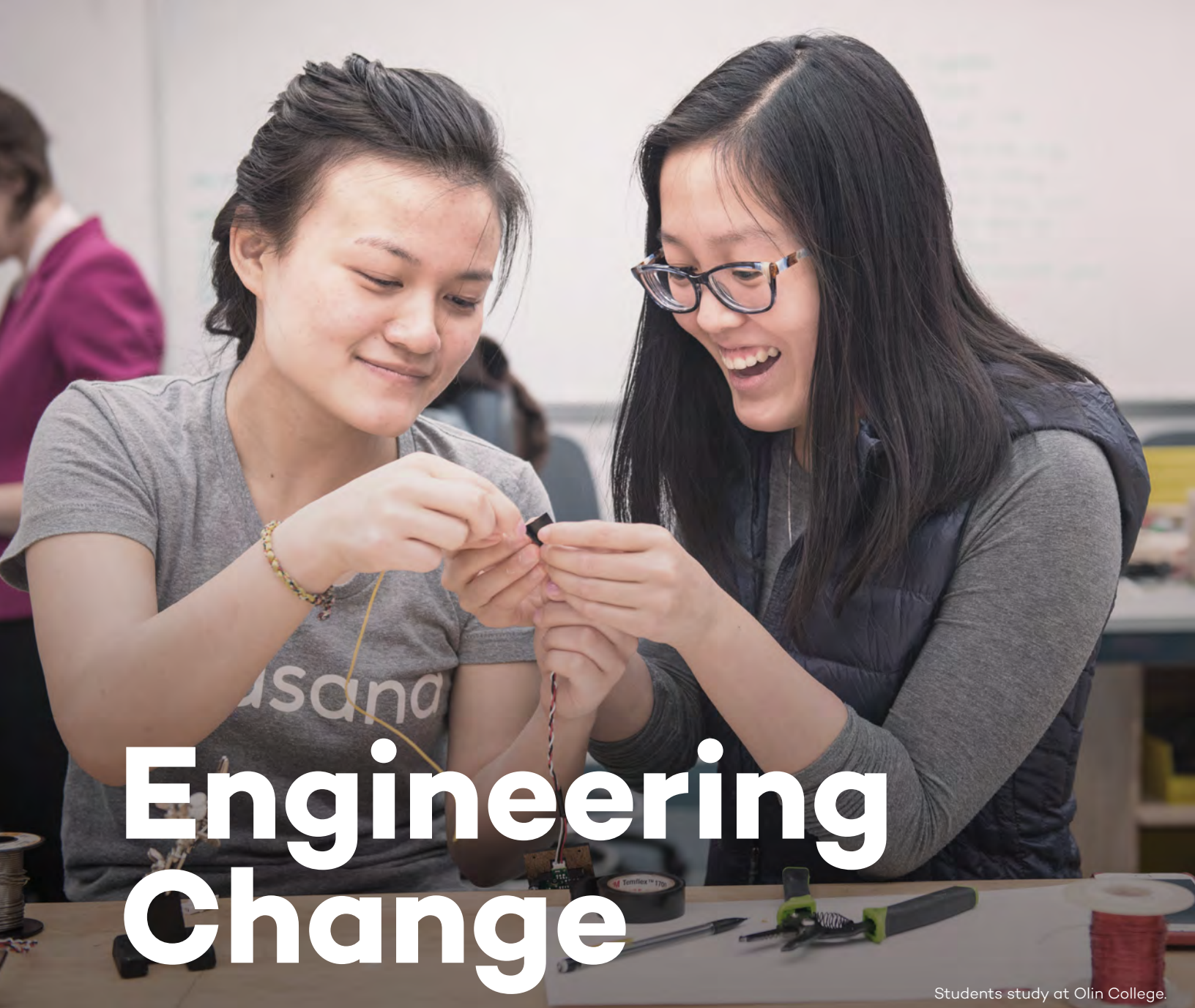
Students study at Olin College.