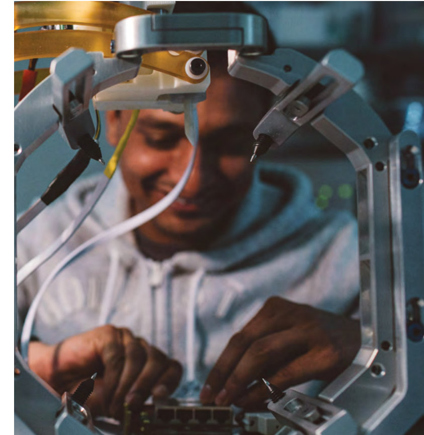
Student at Worcester Polytechnic Institute.

students how to build the body of a robot, while computer science focuses on how to control its behavior. Studies aren’t limited to just the technological aspects of the field. Students are also well-versed in the social and ethical implications of robotics.